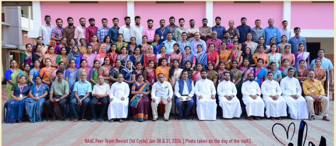
NAAC Peer Team Revisit (1st Cycle) Jan 30 & 31, 2024. [Photo taken on the day of the visit.]